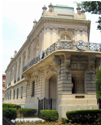
Perry Belmont House