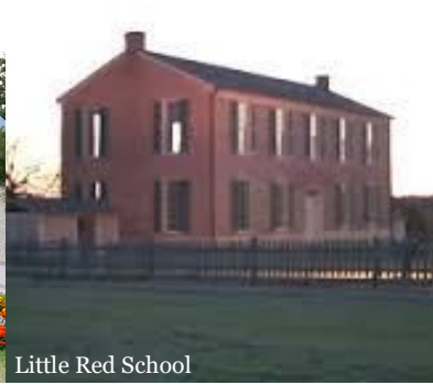
Little Red School